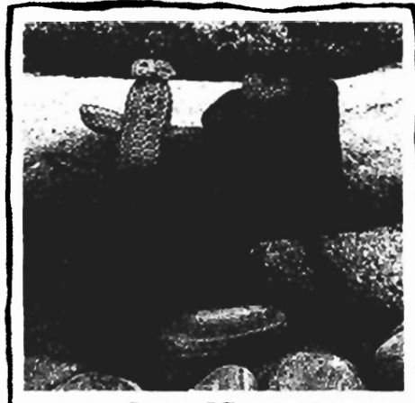
These jolly pop-up plants will give many hours of playtime fun.

Measurement: Cactus body measures 5cm [2in] in length.